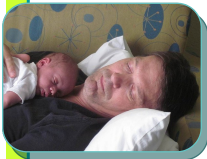
Where sleeping princes lay.....

Call to receive information on any of these adoption options!