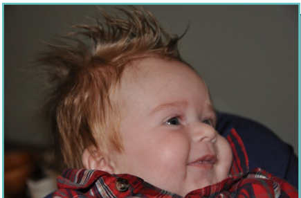
Cool Little Dude with the hair do!!!!!!