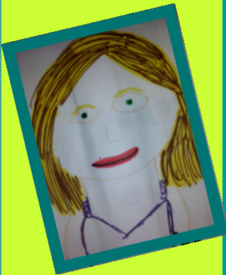
12 year old child's Self Portrait

We would love to feature a photo of your child in our newsletter. Please be sure to send us submissions to include at